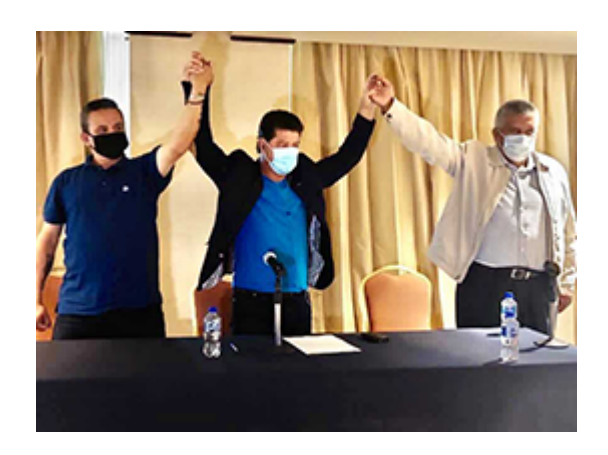
Unifor stands in solidarity with Mexican auto workers in their fight for free, fair and transparent votes by all members as they fight