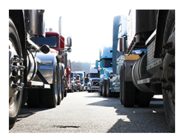
Unifor's new campaign calls for more rest stops for Ontario's longhaul truckers to help keep highways